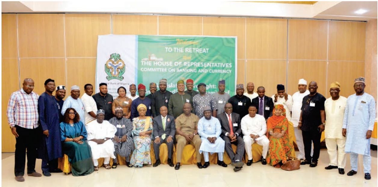
CBN Governor, Mr. Godwin Emefiele and some executives of the Bank with members of the House of Representatives Committee on Banking and Currency.

and creating jobs at the height of recession, stressing that there were structural inefficiencies in the economy that the Bank had to correct.