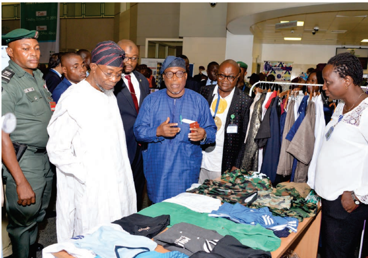
Government officials with some members of the uniformed services inspecting locally made textile at the CBN Head Office

According to him, the ceremony, which also attracted four State Governors (Kaduna, Cross River, Gombe and Katsina), two ministers and Service Chiefs as well as Heads of Uniformed Services and labour leaders, was the result of almost two years of painstaking activities and consultations with key stakeholders in the CTG value chain.