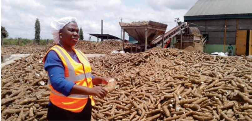
Cassava being processed

In line with the economic diversification drive of the Federal Government, the Central Bank of Nigeria (CBN), has declared its intention to intervene in cassava production to stop the importation of cassava derivatives valued at about $600 million annually.