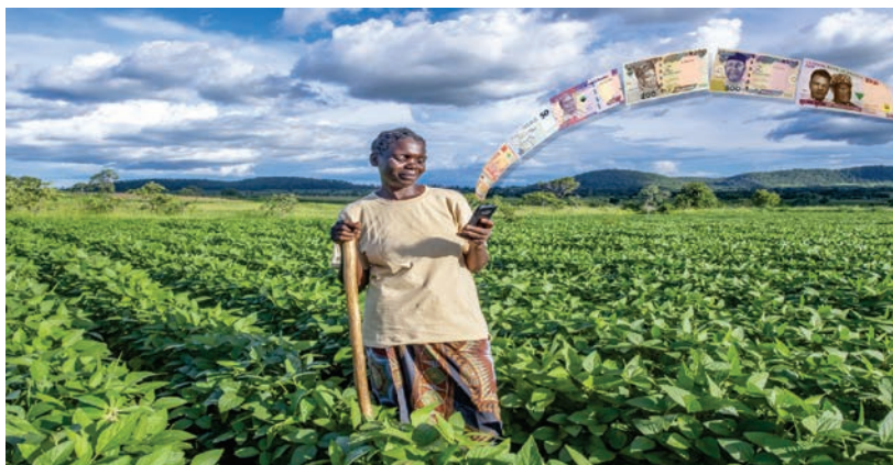
Ease of payment system

The Central Bank of Nigeria (CBN) has issued new regulations for the operation of indirect participants in the Payments System which is to take effect from 11th November, 2019.