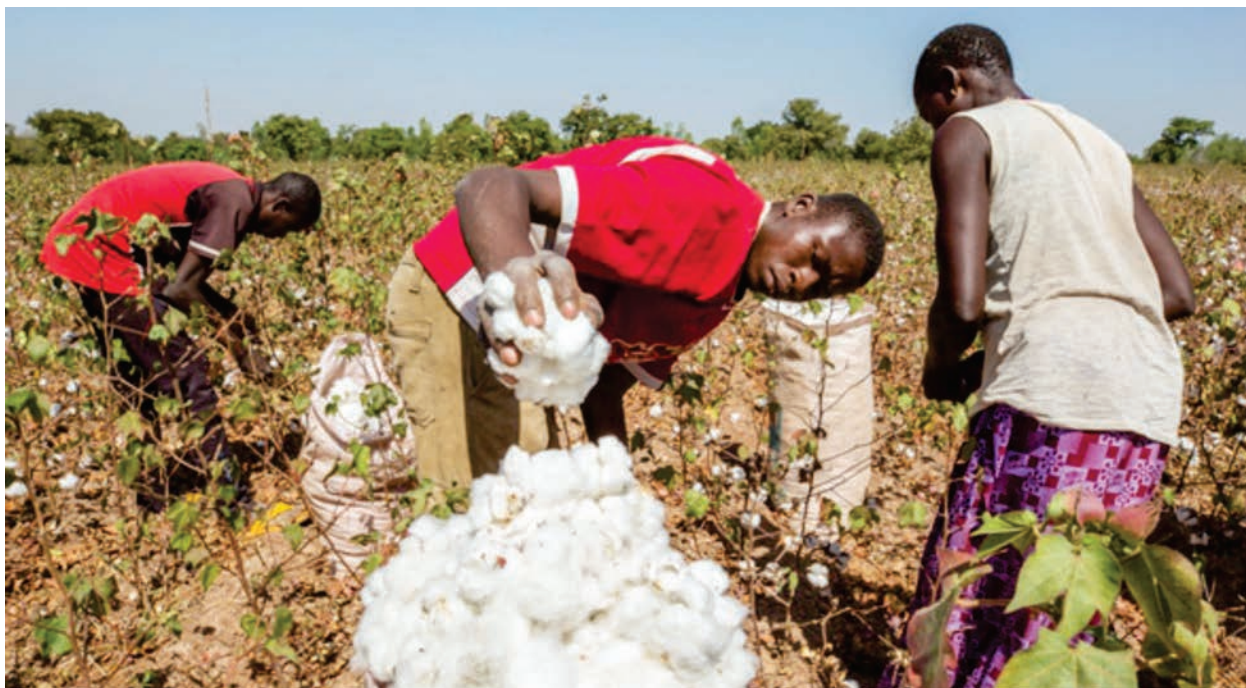
Cotton farmers harvesting their crops

The Central Bank of Nigeria (CBN) has approved a single-digit interest rate facility of N19.2 billion to nine cotton processing firms for retooling their factories and boosting production capacity.