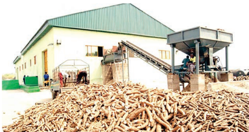
A cassava processing plant

In furtherance of its assured five million new jobs in the next five years, the CBN as part of its strategy, is set to boost cassava production from 50 million tonnes to 830, 820 metric tonnes by supporting the 51,388 cassava farmers in the country.