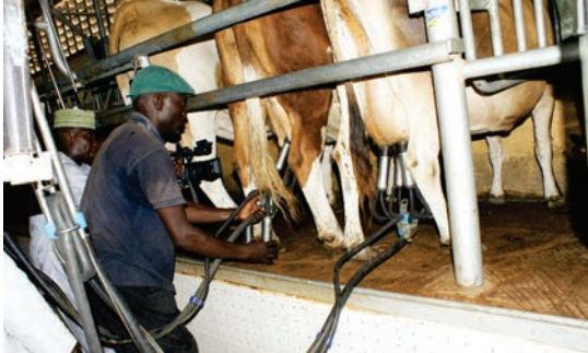
Cows being milked

The Central Bank of Nigeria (CBN) has announced the impending investment in milk production in Nigeria. This is due to the high cost of importation of dairy products amounting to $1.5 billion spent on milk and dairy products. The investment will be done to enhance the resolve of backward integration to conserve foreign exchange and create jobs for the people.