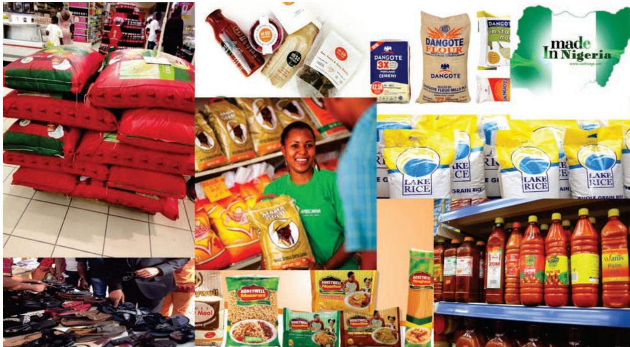
Boost in the Nigerian economy

Conversations of different shades continue on Nigeria's partial land border protection, but one agreeable fact is that the Nigerian Government ought to have taken the decision years back. Smuggling activities, particularly of rice and petroleum products, and unwholesome security breaches in and around the borders, were the reasons the government gave for its action.