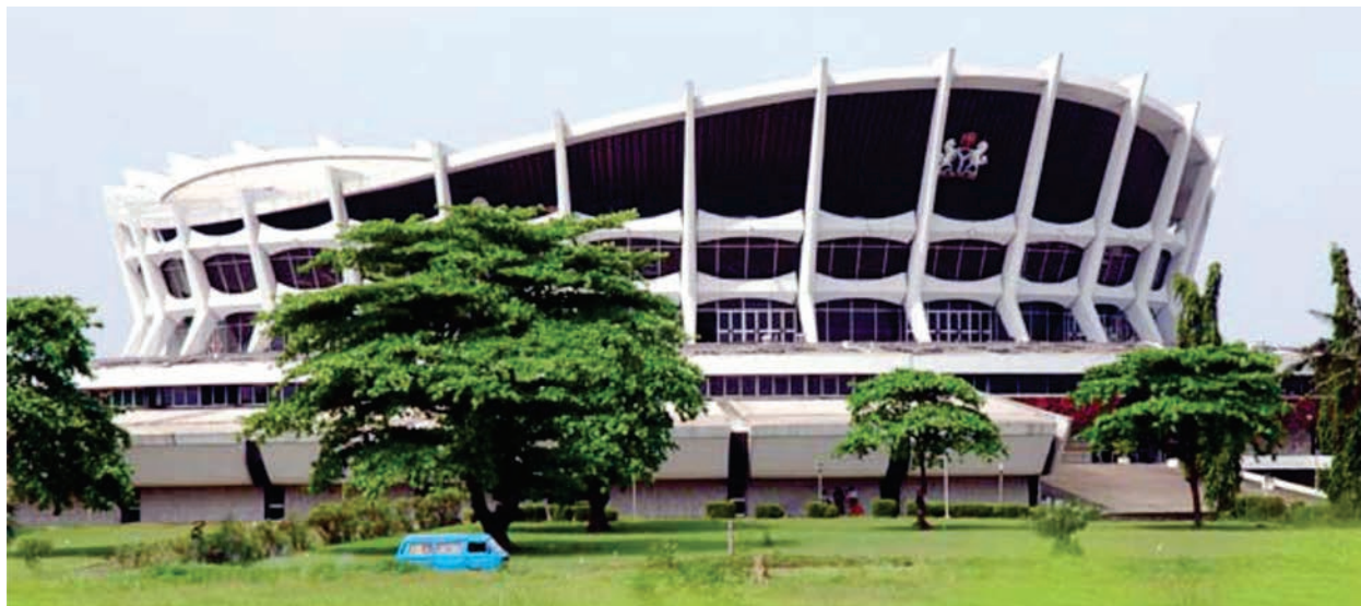
National Arts Theater, Iganmu Lagos

In a bid to tackle the menace of unemployment and boost job creation particularly among youths, the Central Bank of Nigeria (CBN) in collaboration with Bankers' Committee has introduced a Creative Industry Financing Initiative (CI-FI) to improve access to long-term, low-cost financing for entrepreneurs and investors in Nigeria.