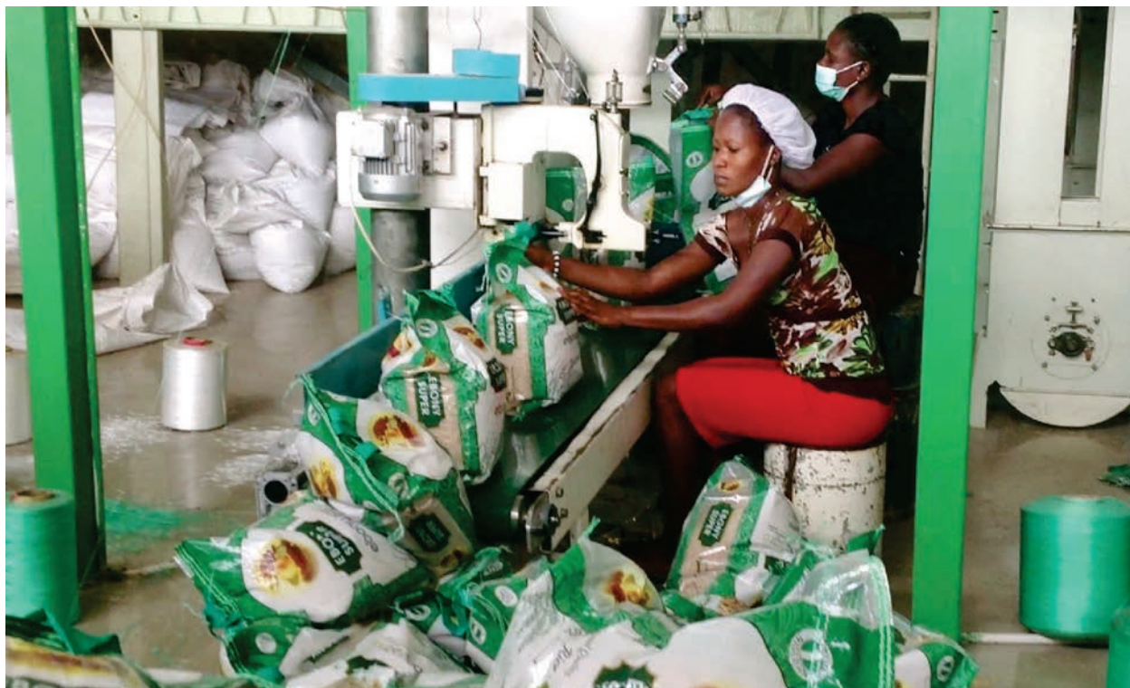
Rice millers in operation

The Governor, Central Bank of Nigeria (CBN), Mr. Godwin Emefiele, has extracted commitments from the National Rice Millers Association of Nigeria (NRMAN) and Nigeria Rice Dealers and Suppliers for the supply of rice as well as ensuring its availability to merchants to ensure supply across the country.