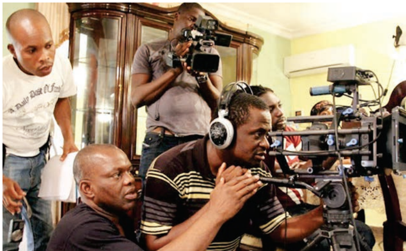
Some members of the creative industry in action

The Central Bank of Nigeria (CBN) in conjunction with the Bankers' Committee is set to support the growth of the creative industry comprised mainly of fashion, information technology, film and music through the Creative Industries and Financing Initiative (CI-FI) with an initial N22 billion funding.